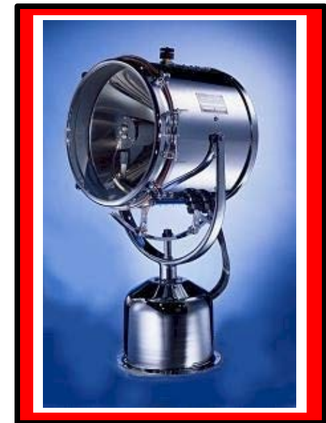
500 Watt Xenon 45 Million Candlepower Distance = 6KM (4 Mi.)