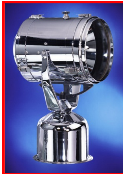
350 Watt Xenon 25 Million Candlepower Distance = 4.5KM (3 Mi.)