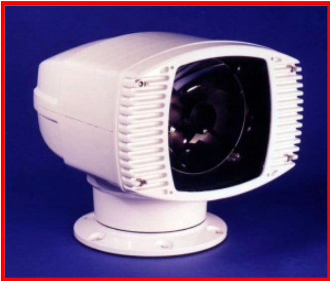
200 Watt Xenon 15 Million Candlepower Distance = 3KM (1.85 Mi.)